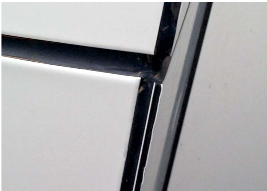
Photograph showing the PE core of Aluminium Composite Panel.

It is common for product specifications to include certification to various fire test standards. Currently Chubb Risk Engineering Services accepts large scale fire tests in accordance with the requirements of the following fire test standards: AS 5113:2016, BS 8414 and ISO 13785. While the AS 1530.1 small scale combustibility test of the core material is also accepted by Chubb Risk Engineering Services, the small